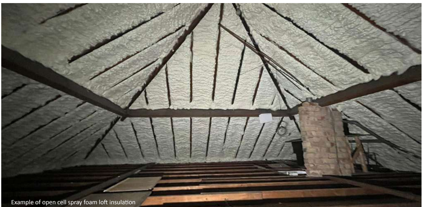
Example of open cell spray foam loft insulation